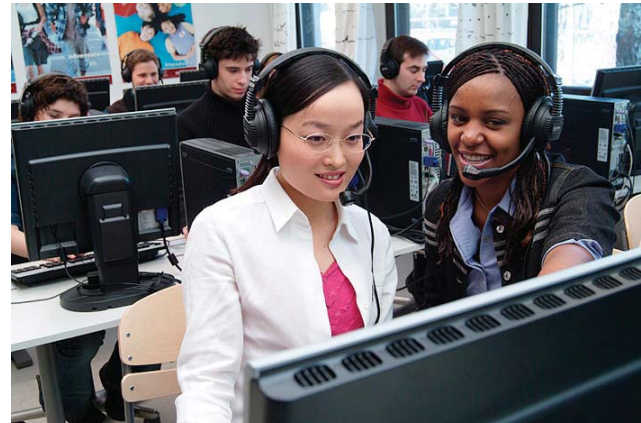
SANAKO Lab 300 functionalities give teachers full control of the class.