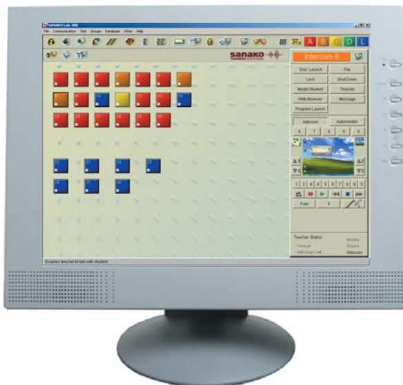
SANAKO Lab 300 Teacher Software

Sanako Lab 300 allows teachers to view a graphical representation of the classroom on their screens, create and work through the lessons and exercises, and to file, save and analyze test results. The seamless integration of the student user interface, Media Assistant Duo , with the Lab 300 Teacher Software's management capabilities allows both teachers and students to take full advantage of all the existing multimedia resources. The Lab 300 Media Assistant Duo has many powerful and fully interactive features, including digitization, saving in various formats, subtitling and bookmarks.